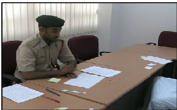
FIGURE 3 TABLETOP SETUP

In the tabletop experiment (Figure 3) the user was presented with a 2D map of the accident scenario which had movable stickers on top of it that can be moved around the scene to represent each of the drivers, the injured person, and the vehicles. If the investigator, for example, wants to move somebody away from a danger zone he could move the representative sticker of that person to a safe location. The two actors required for the scenario sat across the table from the trainee. The operator controlled the moving of the stickers representative of the resources requested by the investigator such as the ambulance, and the towing-trucks.