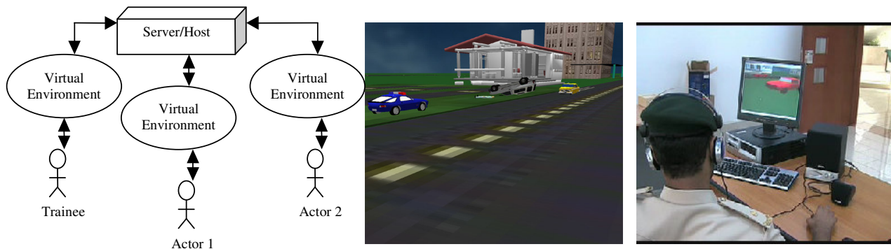
FIGURE 4 LEFT: VIRTUAL EXPERIMENT NETWORK SETUP; CENTER: THE ACCIDENT SCENE IN THE VIRTUAL ENVIRONMENT; RIGHT: VIRTUAL EXPERIMENT

experimental sessions were videotaped and analysed afterwards to measure the performance. The trainee's performance was measured using two variables: the investigative score (Table 1) and the investigation duration.