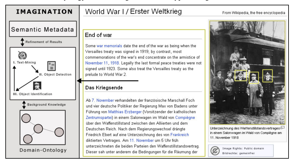
Figure 1 : IMAGINATION technology applied to Wikipedia

step considers the already available semantic information to improve its results and thus to achieve a synergy effect among the different types of algorithms.